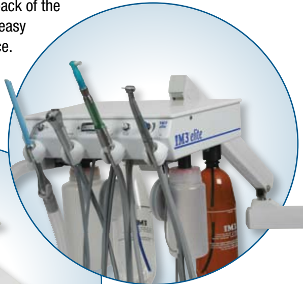
(Top Left) Stainless steel height adjustable stand. (Above) Optional height adjustable wall arm. (Left) Stainless steel instrument tray